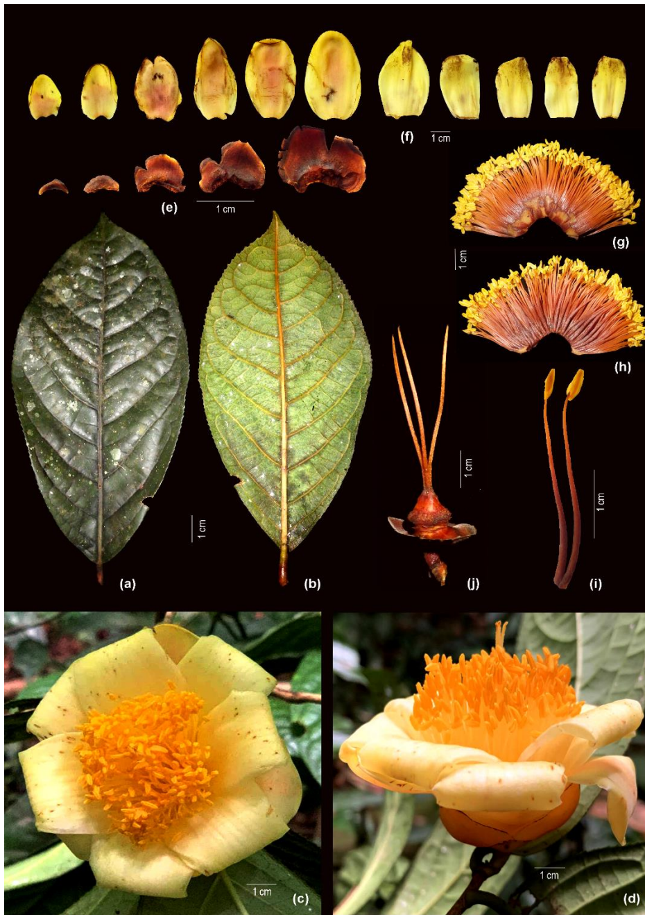
Figure 2. Camellia hoabinhensis V. D. Luong, Tran & V. T. Pham (fresh specimens)

Notes: (a, b) Leaves, adaxial (left) and abaxial (right); (c, d) Flowers, front and lateral views;