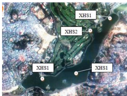
Figure 1. Locations of sampling in Xuanhuong Lake